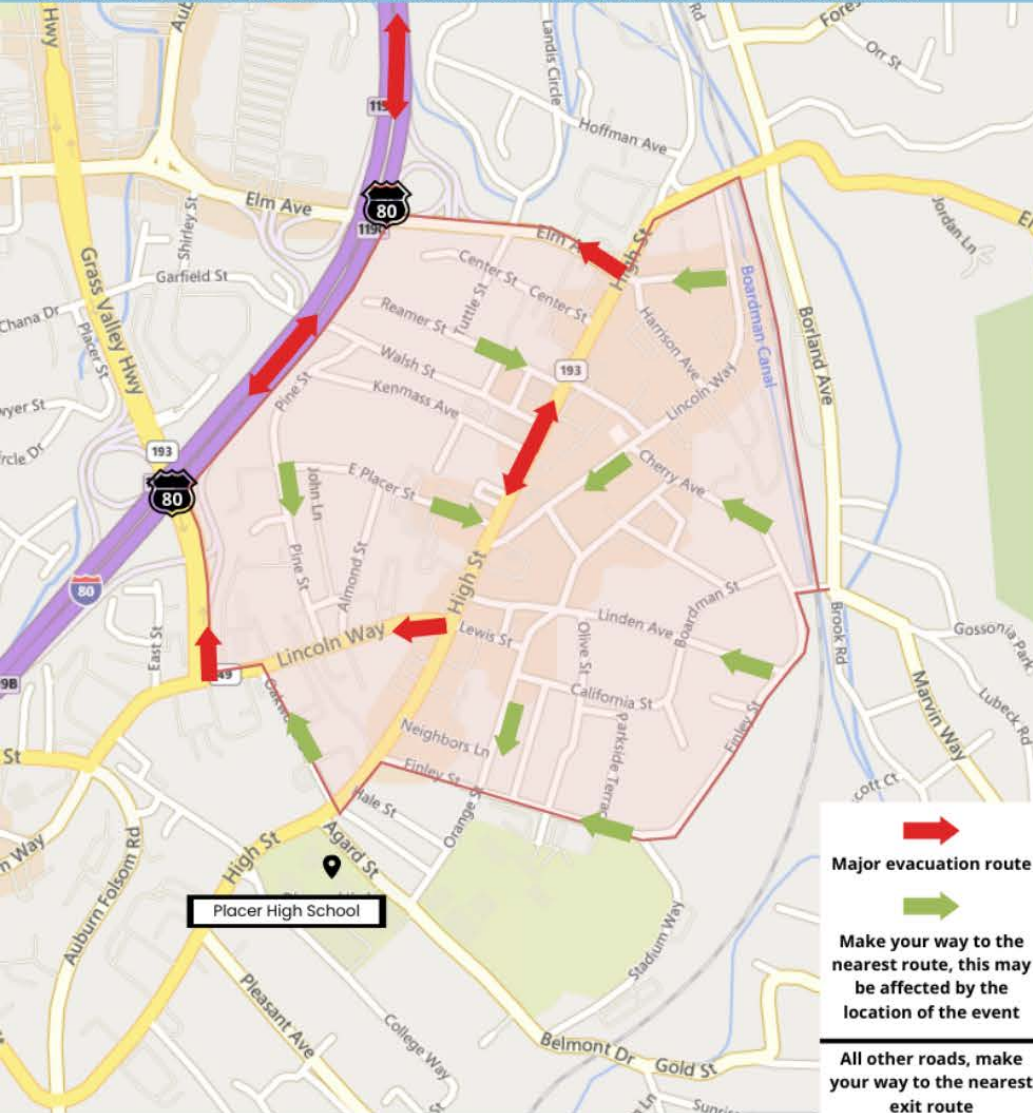
Reporting District 13

FAMILIARIZE YOURSELF WITH MAJOR ROUTES AND, IF POSSIBLE, MULTIPLE WAYS OUT OF YOUR NEIGHBORHOOD IN CASE OF AN EVACUATION