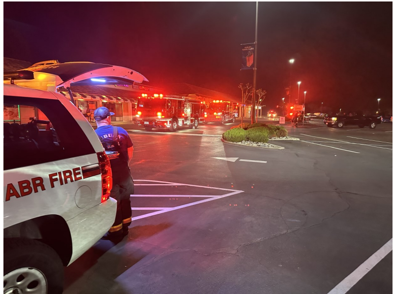
B12 and E1282 at scene of a commercial structure fire (Nancy's Café) on March 26th. The fire was contained to a used towel hamper and business was restored to normal within 24 hours.